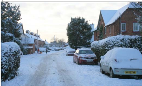
School Lane in January

Some people might not want anyone poking their nose in or there's the risk of having it bitten off! - "We are Ok, thank you very much!" If on the other hand you are someone who is stuck indoors and cannot get out, please ring someone. A friend or relative, the surgery or chemist may find someone to drop off your prescription, the local shop can deliver groceries. Come to that ring the Editor – I'm sure she won't mind – and if she's not in you will probably get me and I can pass on a message to someone who can help you.