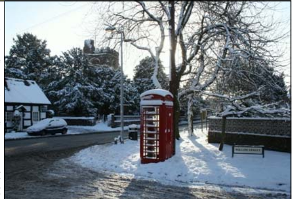
Willow Street & High Street in January

This winter having retired, I didn't worry about struggling to work, I could sit in my cocoon of warmth and watch the weather go by. It got me thinking however, about those who couldn't get out for whatever reason and wondered who would help them out. I'm talking here about those souls not in the Social Services loop, who are reasonably fit, but in recent weather conditions, just couldn't get out. Who was looking after them? It reminded me that we should all have an eye out for our neighbours – has anyone seen or heard from them lately?